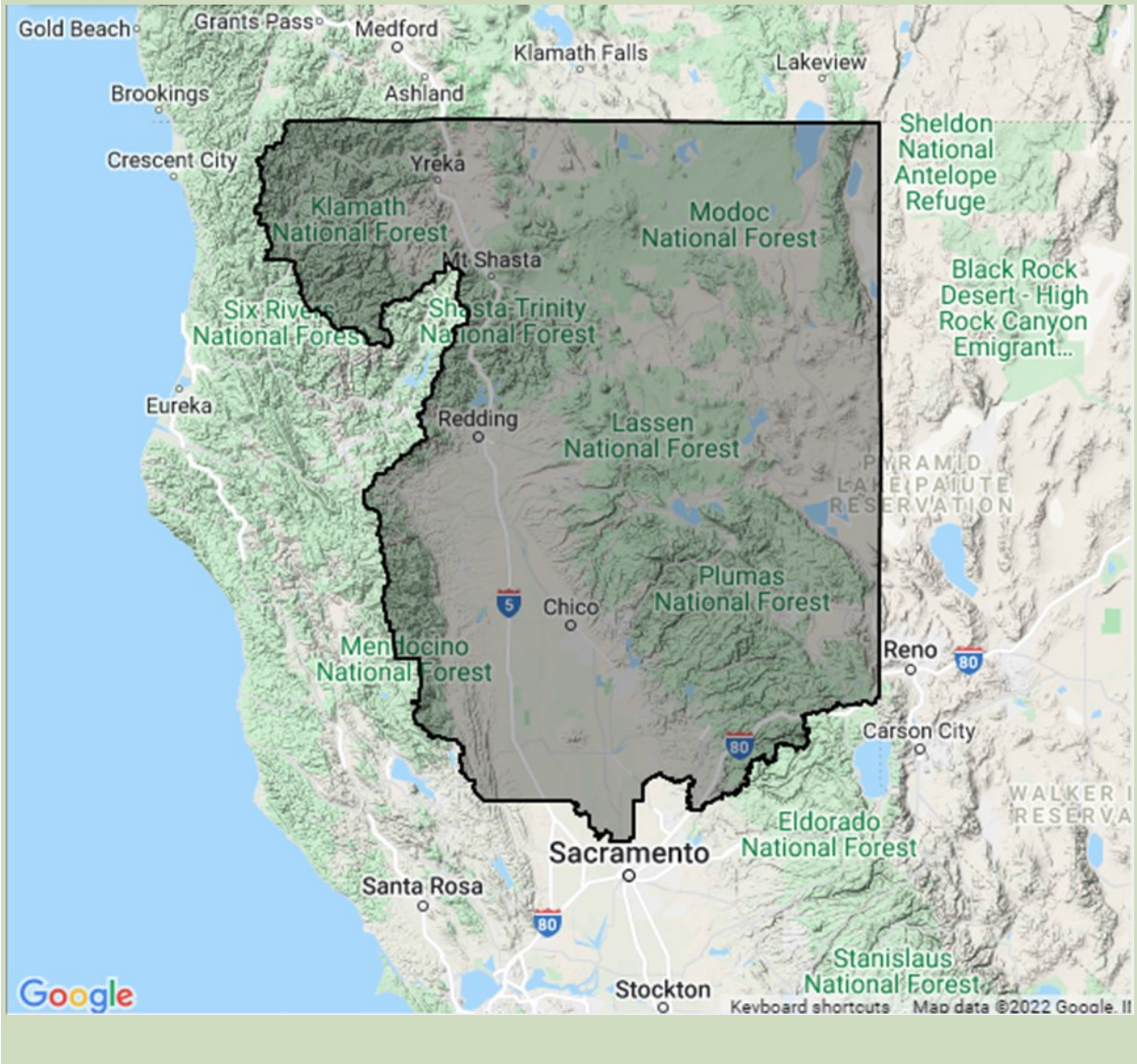
New Senate District 1 (SD 1)