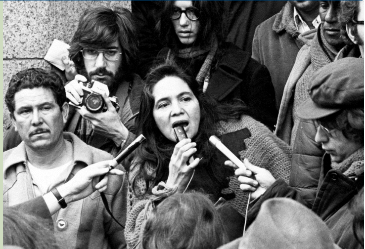
United Farm Workers' Dolores Huerta organizing farm workers in Coachella, California, in 1969

In a striking example of how men can claim all the recognition and credit for great work, Dolores Huerta stood in the shadow of Cesar Chavez.