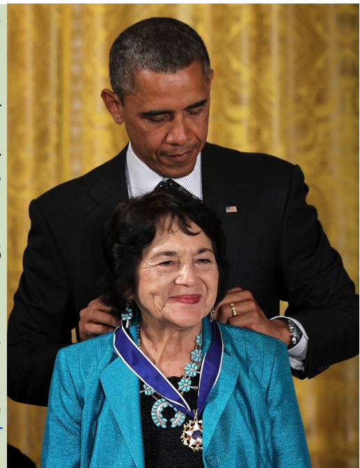
In 2011, President Obama gave Dolores Huerta the Presidential Medal of Freedom.

In California, April 10 is Dolores Huerta Day.