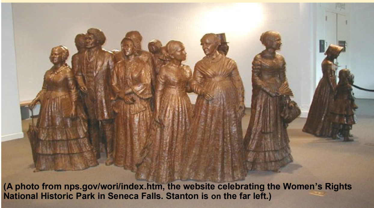
Stanton is on the far left.)

The second: The Women's Rights Convention, held in 1848. One of the earth-shaking items of this event: Elizabeth Cady Stanton's "Declaration of Sentiments," presented to an enthusiastic crowd of 300, mostly women. She based it on the seven-decades old Declaration of Independence, stating that "We hold these truths to be self-evident: that men and women are created equal; that they are endowed with by their creator with certain inalienable rights; that among them are life, liberty and the pursuit of happiness."