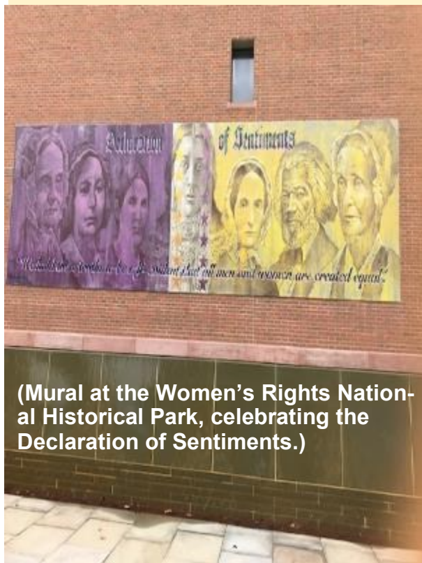
(Mural at the Women's Rights National Historical Park, celebrating the Declaration of Sentiments.)

Seneca Falls celebrates the energy of the women who started the idea of equality for women, which included suffrage. Now we tend to take women’s suffrage for granted. After all, if you want to vote, you do. Simple, right? Of course, simple. But it took so long to happen that only one woman who signed the Declaration of Sentiments in 1848 was alive when 1920 rolled around and it became legal for women to vote in the United States. And she couldn’t, because she was ill and 90 years old.