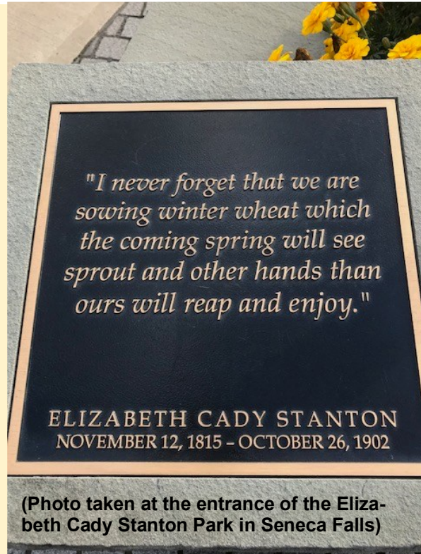
(Photo taken at the entrance of the Elizabeth Cady Stanton Park in Seneca Falls)

This Convention, the women’s “Declaration of Sentiments” and the demand for the right to vote were, of course, considered revolutionary and radical. However, men had these rights. Why not women? It seemed so sensible, so reasonable. The astonishing part is that most of the women (and 32 men) who signed their names supporting this Declaration would never see the results of their energy and work. They held the Convention 72 years after Thomas Jefferson wrote the Declaration of Independence; Congress would not ratify the 19th amendment for another 72 years.